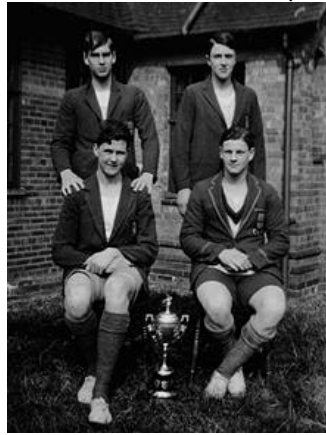
Old Reptonians, including Roald Dahl (top right) at school in 1931.

Roald Dahl's schooldays were filled with the ritual cruelty of fagging and with terrible beatings.